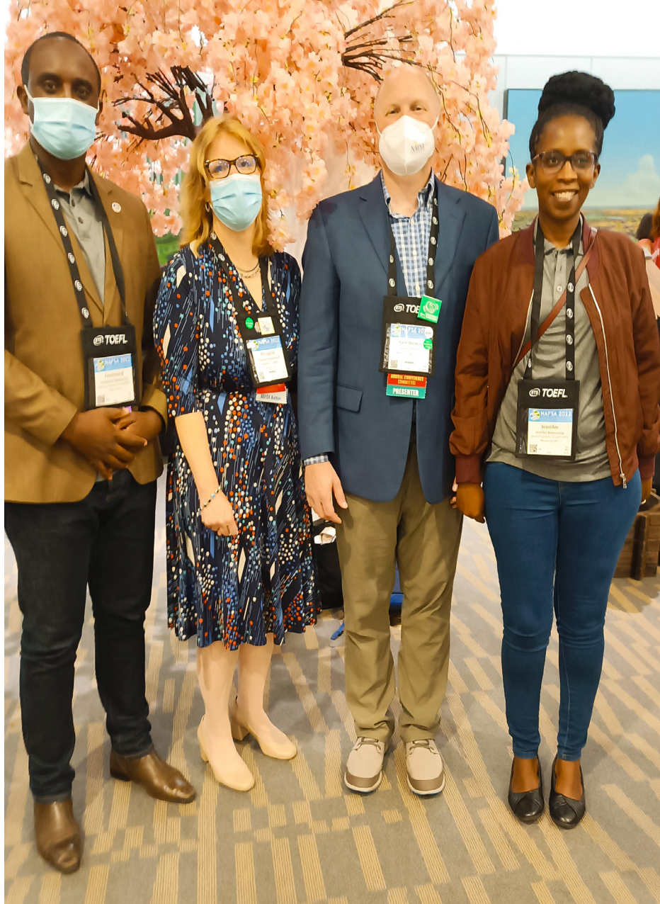
AUCA staff pose with the NAFSA outgoing and incoming presidents, during the NAFSA meeting in Denver, Colorado.

UPEX Fellows also participated to NAFSA Annual Conference and Expo in Denver, Colorado from (May 31 to 03 June 2022). NAFSA is the world's largest