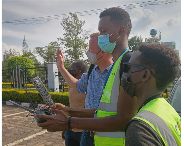
PHOTOS: March 2022: Andrews team during the ground works' sessions and initial stages of the production of AUCA revamped Master Plan.