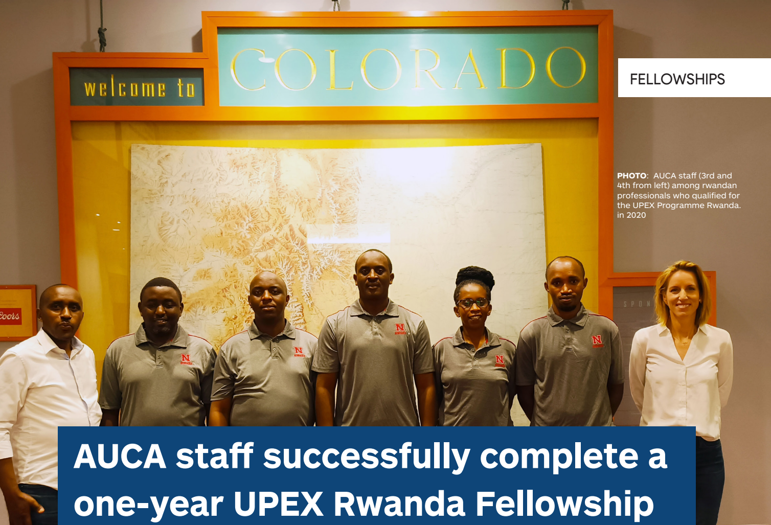
PHOTO: AUCA staff (3rd and 4th from left) among rwandan professionals who qualified for the UPEX Programme Rwanda, in 2020