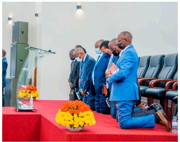
PHOTOS: Church leaders, staff, local population and students during the dedication service for Ngoma SDA Memorial Church on 06 April 2022.